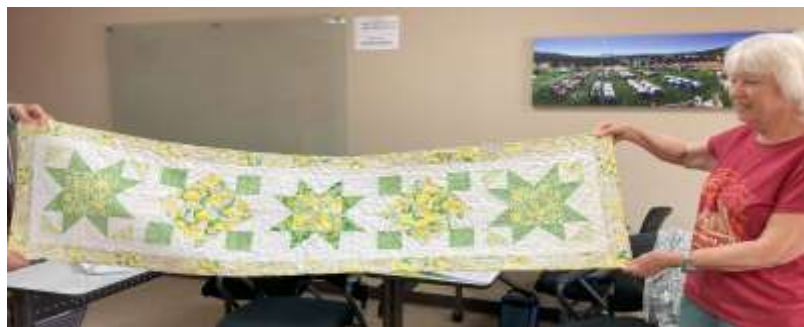
Summer Lemons by Georgia (the good).