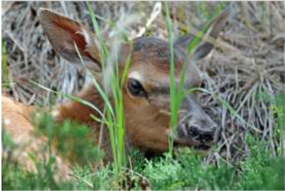
For more great ShutterBug pictures, check out pages 12-14.

Take a peek inside for the latest ENN news!