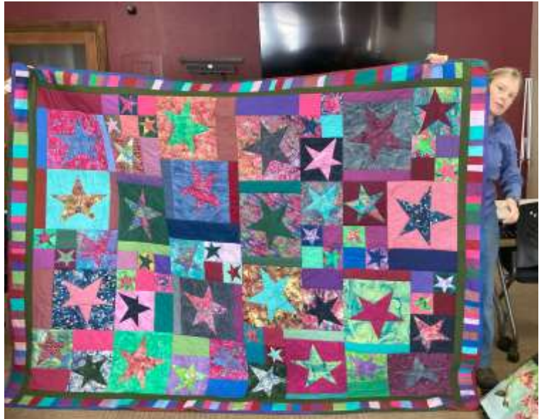
Amazing stars by Rache!!