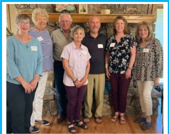
Your 2024-25 ENN Board

Next Newsletter Deadline: September 20th for Group Recaps and Sept/Oct Newsletter information.