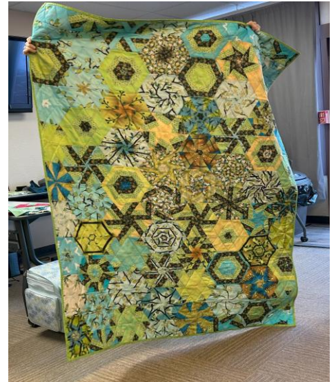
Wow! Georgia's Kaleidoscopes are amazing!