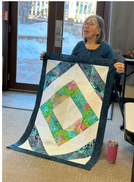
Mindy's Diamonds are so soothing!