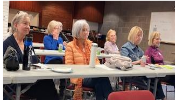
We had lots of questions and got good answers!