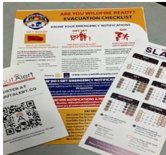
Do you know what to do??