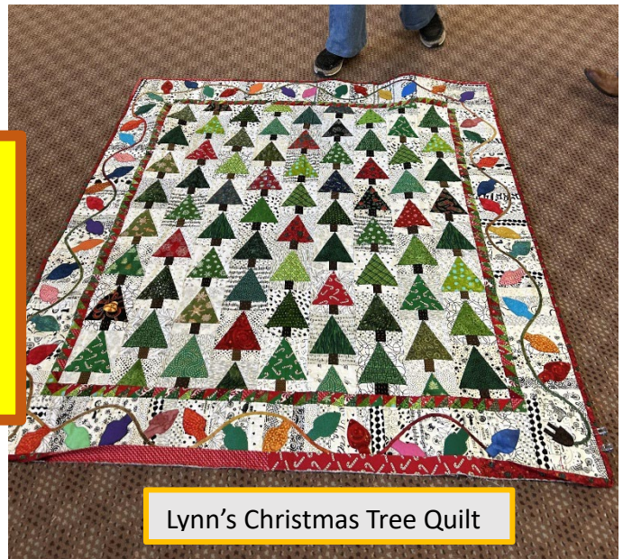
Lynn's Christmas Tree Quilt

Happy Holidays from the Blue Sky Quilters!