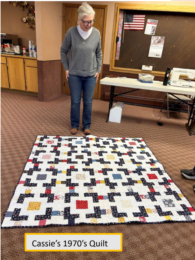
Cassie's 1970's Quilt