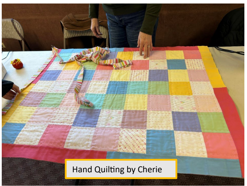
Hand Quilting by Cherie

Happy Holidays from the Blue Sky Quilters!