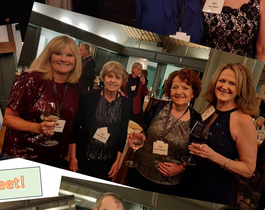
Friendships meet and greet!